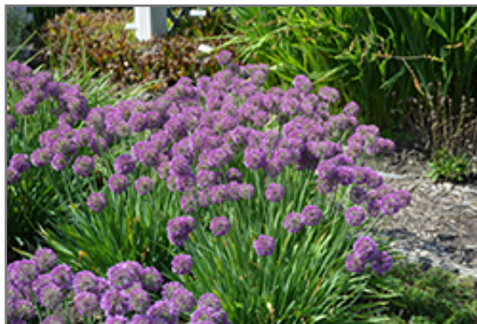
Lavender Bubbles Ornamental Onion in bloom

Lavender Bubbles Ornamental Onion is recommended for the following landscape applications;