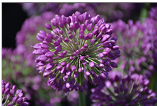
Lavender Bubbles Ornamental Onion flowers