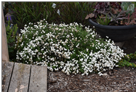
Peter Cottontail Yarrow in bloom