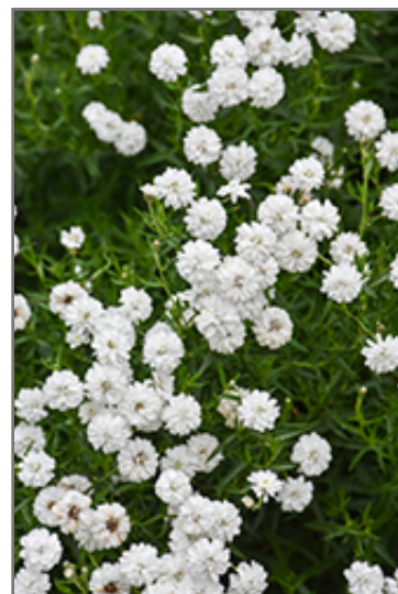
Peter Cottontail Yarrow flowers