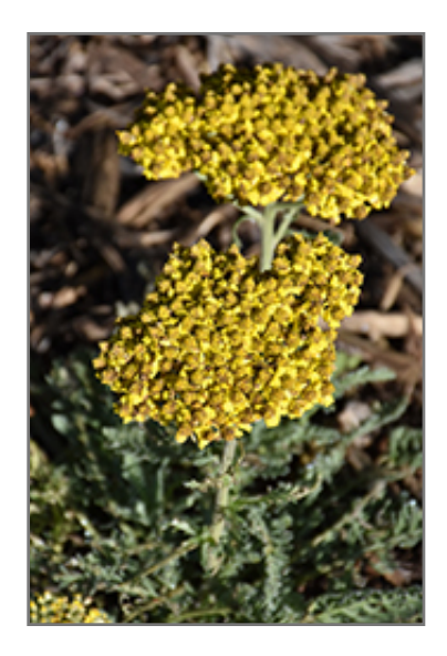
Sassy Summer Silver Yarrow flowers

Sassy Summer Silver Yarrow is recommended for the following landscape applications;