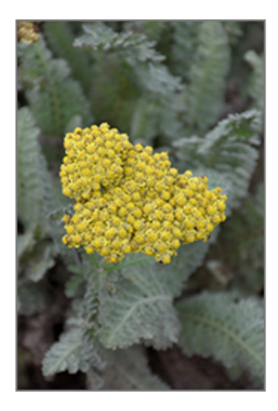
Sassy Summer Silver Yarrow flowers