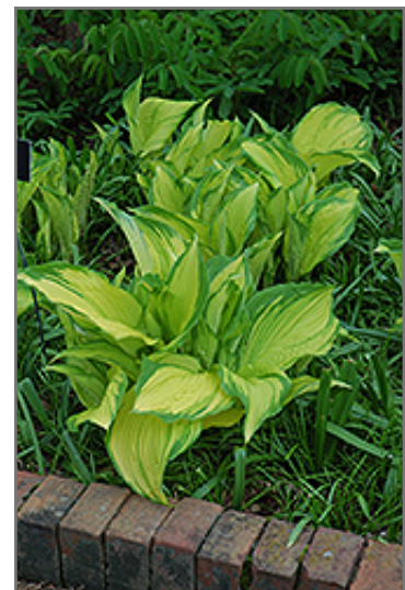
On Stage Hosta