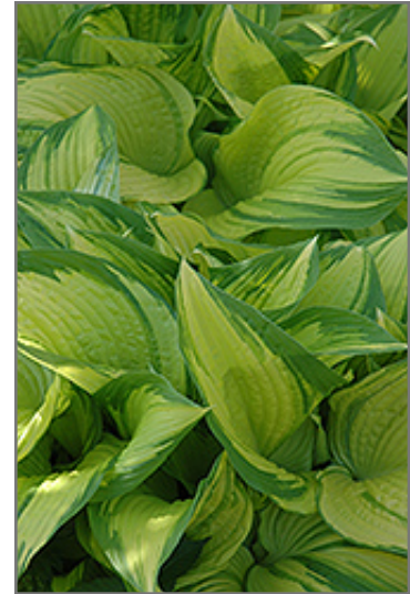
On Stage Hosta foliage

On Stage Hosta is recommended for the following landscape applications;