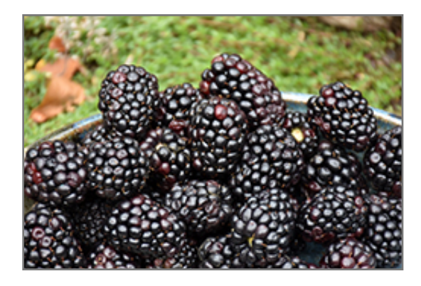
Triple Crown Blackberry fruit

This is an open multi-stemmed deciduous shrub with a spreading, ground-hugging habit of growth. Its relatively coarse texture can be used to stand it apart from other landscape plants with finer foliage. This is a high maintenance plant that will require regular care and upkeep. Each spring, cut back all dead and two-year old canes to the ground, leaving only last year's growth standing. It is a good choice for attracting birds to your yard. Gardeners should be aware of the following characteristic(s) that may warrant special consideration;