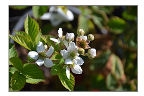
Triple Crown Blackberry flowers