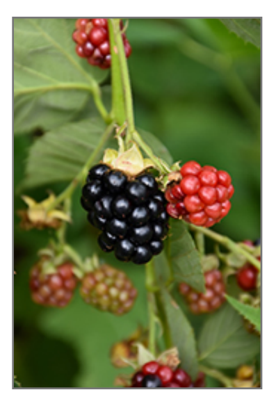
Triple Crown Blackberry fruit