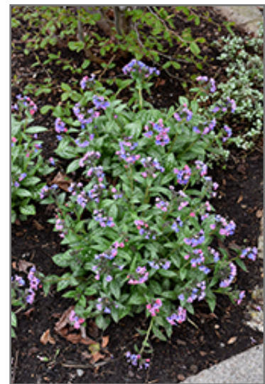
Pretty In Pink Lungwort in bloom