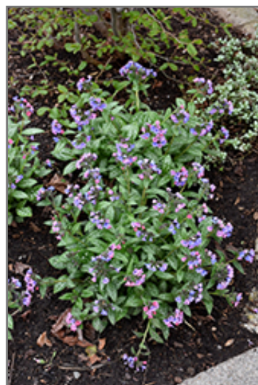
Pretty In Pink Lungwort in bloom