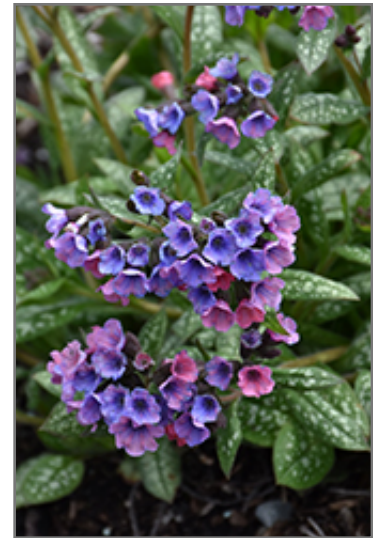
Pretty In Pink Lungwort flowers

Pretty In Pink Lungwort is recommended for the following landscape applications;