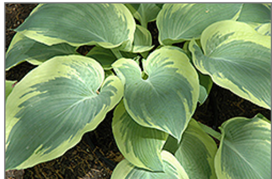
Northern Exposure Hosta foliage