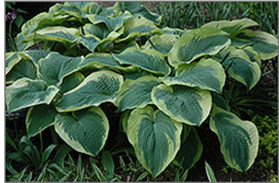
Northern Exposure Hosta

Northern Exposure Hosta is recommended for the following landscape applications;