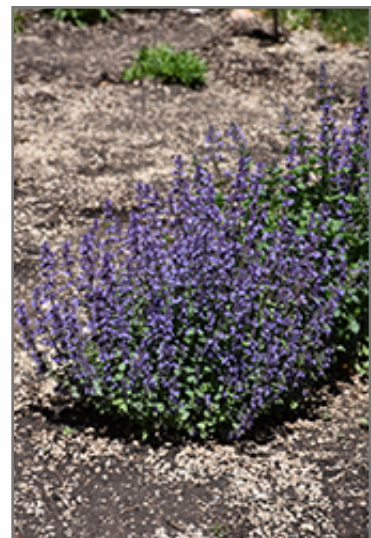
Cat's Pajamas Catmint in bloom