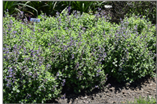
Cat's Pajamas Catmint in bloom

Cat's Pajamas Catmint is a fine choice for the garden, but it is also a good selection for planting in outdoor pots and containers. It is often used as a 'filler' in the 'spiller-thriller-filler' container combination, providing a mass of flowers against which the thriller plants stand out. Note that when growing plants in outdoor containers and baskets, they may require more frequent waterings than they would in the yard or garden. Be aware that in our climate, most plants cannot be expected to survive the winter if left in containers outdoors, and this plant is no exception. Contact our experts for more information on how to protect it over the winter months.