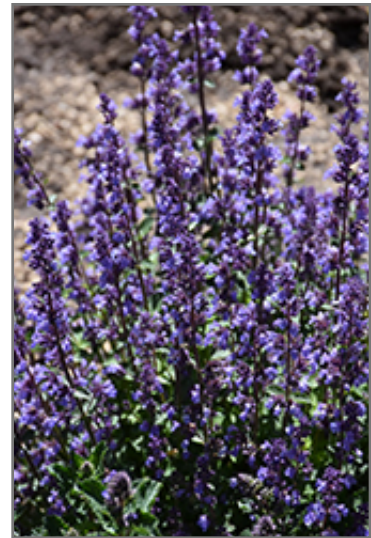
Cat's Pajamas Catmint flowers