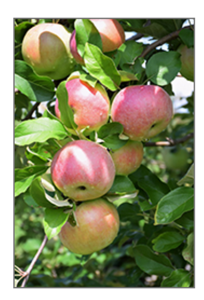
Northern Spy Apple fruit

This is a deciduous tree with a more or less rounded form. Its average texture blends into the landscape, but can be balanced by one or two finer or coarser trees or shrubs for an effective composition. This is a high maintenance plant that will require regular care and upkeep, and is best pruned in late winter once the threat of extreme cold has passed. Gardeners should be aware of the following characteristic(s) that may warrant special consideration;