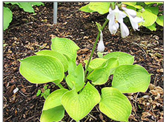
Midas Touch Hosta