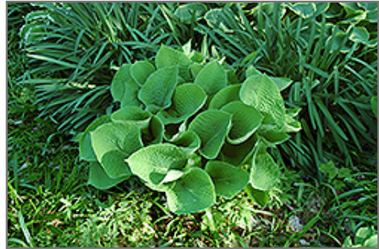
Midas Touch Hosta