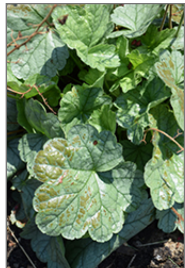
Dolce Spearmint Coral Bells foliage