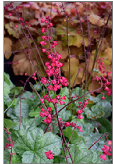
Dolce Spearmint Coral Bells flowers

Dolce Spearmint Coral Bells is recommended for the following landscape applications;