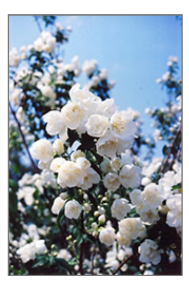
Virginal Mockorange flowers

Virginal Mockorange is covered in stunning clusters of fragrant white flowers with yellow eyes at the ends of the branches in late spring. It has green deciduous foliage. The serrated oval leaves do not develop any appreciable fall colour.