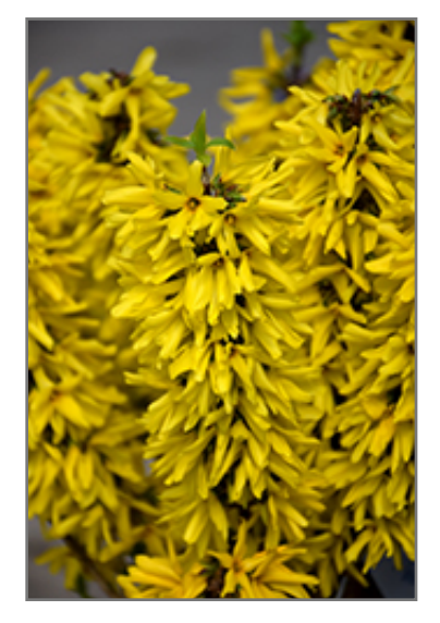
Show Off Sugar Baby Forsythia flowers

Show Off Sugar Baby Forsythia is recommended for the following landscape applications;