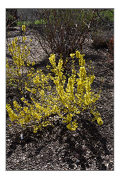
Show Off Sugar Baby Forsythia in bloom