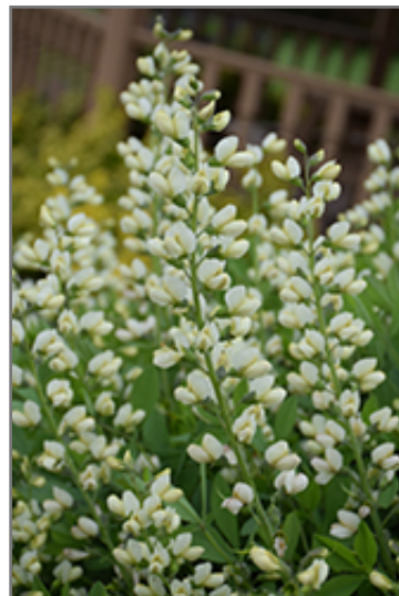
Decadence Vanilla Cream False Indigo flowers

Decadence Vanilla Cream False Indigo is an herbaceous perennial with an upright spreading habit of growth. Its medium texture blends into the garden, but can always be balanced by a couple of finer or coarser plants for an effective composition.