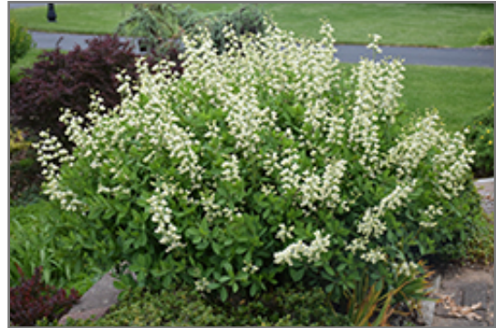
Decadence Vanilla Cream False Indigo in bloom

Decadence Vanilla Cream False Indigo is a fine choice for the garden, but it is also a good selection for planting in outdoor pots and containers. With its upright habit of growth, it is best suited for use as a 'thriller' in the 'spiller-thriller-filler' container combination; plant it near the center of the pot, surrounded by smaller plants and those that spill over the edges. It is even sizeable enough that it can be grown alone in a suitable container. Note that when growing plants in outdoor containers and baskets, they may require more frequent waterings than they would in the yard or garden. Be aware that in our climate, most plants cannot be expected to survive the winter if left in containers outdoors, and this plant is no exception. Contact our experts for more information on how to protect it over the winter months.