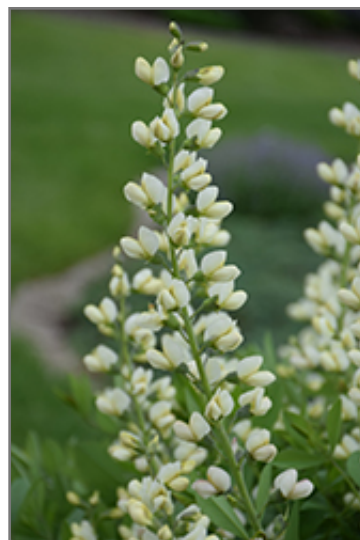
Decadence Vanilla Cream False Indigo flowers