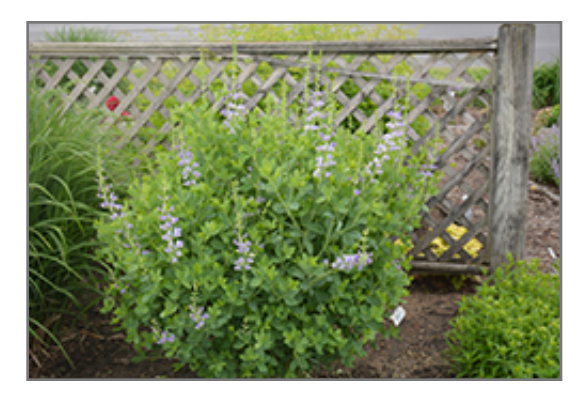
Sky Blue False Indigo in bloom

This is a relatively low maintenance plant, and is best cleaned up in early spring before it resumes active growth for the season. It is a good choice for attracting bees and butterflies to your yard, but is not particularly attractive to deer who tend to leave it alone in favor of tastier treats. It has no significant negative characteristics.