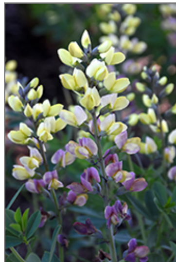
Decadence Deluxe Pink Lemonade False Indigo flowers

This is a relatively low maintenance plant, and is best cleaned up in early spring before it resumes active growth for the season. It is a good choice for attracting bees and butterflies to your yard. It has no significant negative characteristics.