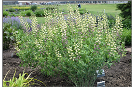
Decadence Deluxe Pink Lemonade False Indigo in bloom

Decadence Deluxe Pink Lemonade False Indigo is a fine choice for the garden, but it is also a good selection for planting in outdoor pots and containers. With its upright habit of growth, it is best suited for use as a 'thriller' in the 'spiller-thriller-filler' container combination; plant it near the center of the pot, surrounded by smaller plants and those that spill over the edges. It is even sizeable enough that it can be grown alone in a suitable container. Note that when growing plants in outdoor containers and baskets, they may require more frequent waterings than they would in the yard or garden. Be aware that in our climate, most plants cannot be expected to survive the winter if left in containers outdoors, and this plant is no exception. Contact our experts for more information on how to protect it over the winter months.