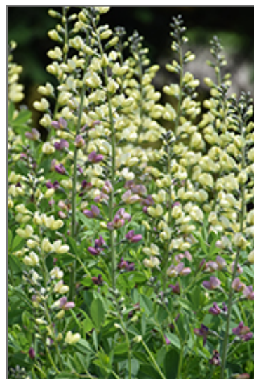
Decadence Deluxe Pink Lemonade False Indigo flowers