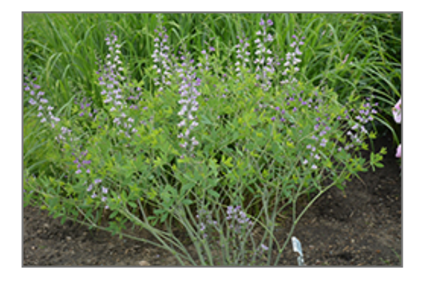
Lavender Stardust False Indigo in bloom

Lavender Stardust False Indigo will grow to be about 3 feet tall at maturity, with a spread of 4 feet. It tends to be leggy, with a typical clearance of 1 foot from the ground, and should be underplanted with lower-growing perennials. It grows at a slow rate, and under ideal conditions can be expected to live for approximately 25 years. As an herbaceous perennial, this plant will usually die back to the crown each winter, and will regrow from the base each spring. Be careful not to disturb the crown in late winter when it may not be readily seen!