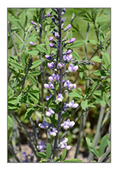
Lavender Stardust False Indigo flowers

This is a relatively low maintenance plant, and is best cleaned up in early spring before it resumes active growth for the season. It is a good choice for attracting bees and butterflies to your yard, but is not particularly attractive to deer who tend to leave it alone in favor of tastier treats. It has no significant negative characteristics.