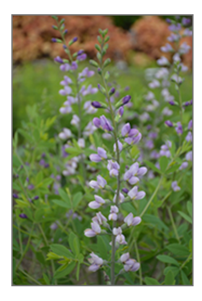
Lavender Stardust False Indigo flowers