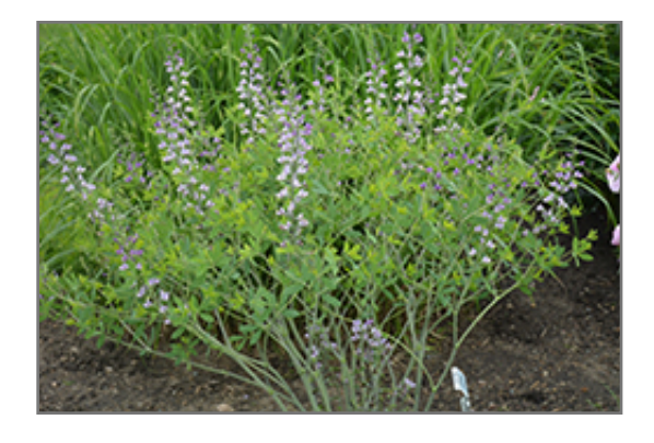
Lavender Stardust False Indigo in bloom