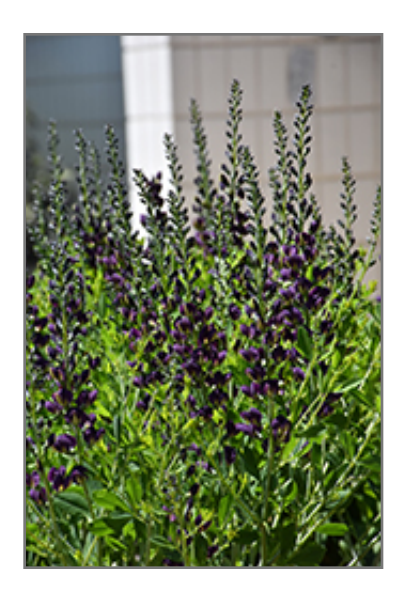
Grape Taffy False Indigo flowers