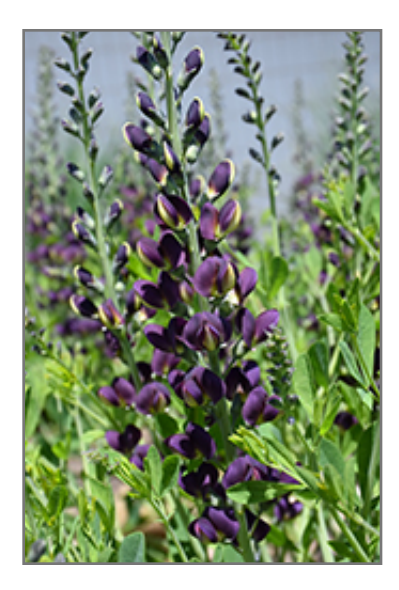
Grape Taffy False Indigo flowers

This is a relatively low maintenance plant, and is best cleaned up in early spring before it resumes active growth for the season. It is a good choice for attracting bees and butterflies to your yard, but is not particularly attractive to deer who tend to leave it alone in favor of tastier treats. It has no significant negative characteristics.