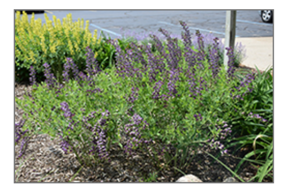
Grape Taffy False Indigo in bloom

Grape Taffy False Indigo will grow to be about 24 inches tall at maturity, with a spread of 30 inches. It tends to be leggy, with a typical clearance of 1 foot from the ground, and should be underplanted with lower-growing perennials. It grows at a slow rate, and under ideal conditions can be expected to live for approximately 25 years. As an herbaceous perennial, this plant will usually die back to the crown each winter, and will regrow from the base each spring. Be careful not to disturb the crown in late winter when it may not be readily seen!