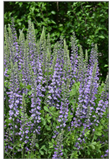
Blue Towers False Indigo flowers

Blue Towers False Indigo is recommended for the following landscape applications;