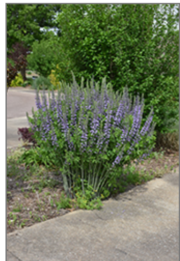
Blue Towers False Indigo in bloom