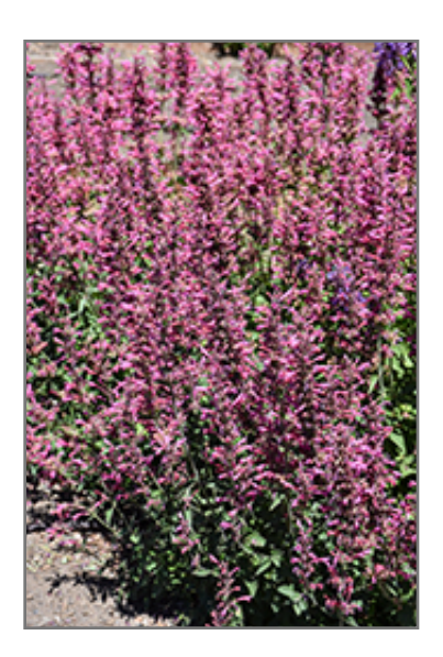
Poquito Lavender Hyssop flowers

This is a relatively low maintenance plant, and is best cleaned up in early spring before it resumes active growth for the season. It is a good choice for attracting bees, butterflies and hummingbirds to your yard, but is not particularly attractive to deer who tend to leave it alone in favor of tastier treats. It has no significant negative characteristics.