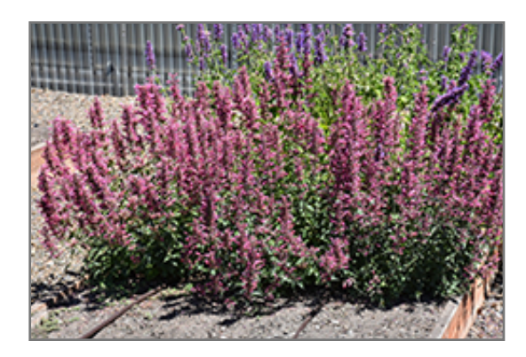
Poquito Lavender Hyssop in bloom