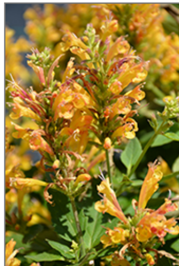
Poquito Butter Yellow Hyssop flowers

Poquito Butter Yellow Hyssop is recommended for the following landscape applications;