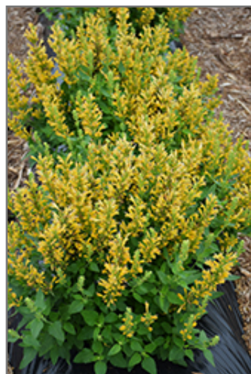
Poquito Butter Yellow Hyssop in bloom