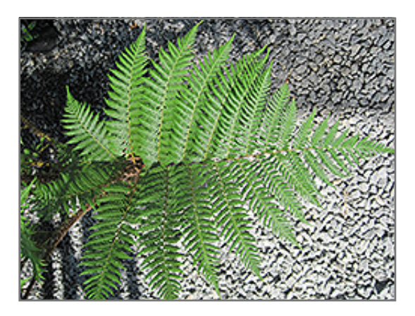
Australian Tree Fern foliage