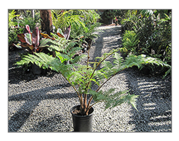
Australian Tree Fern