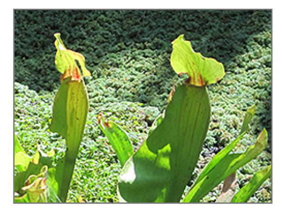
Northern Pitcher Plant