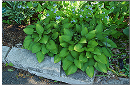
Janet Hosta Photo courtesy of NetPS Plant Finder