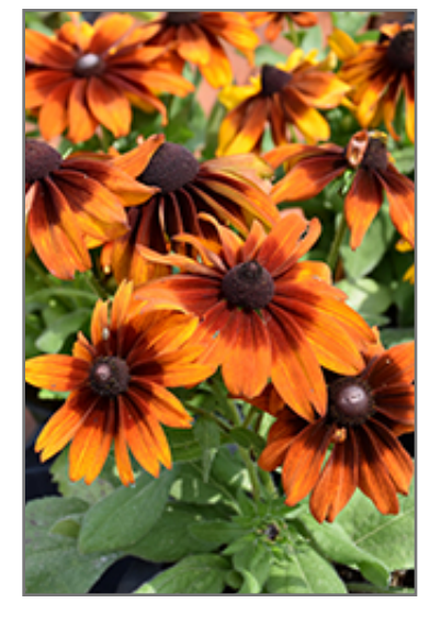
Autumn Colors Coneflower flowers

A stunning variety with flowers that put on a dazzling show; blooms with red-orange centers around yellow-orange edges with brown overlays; long lasting flowers all summer and is the perfect fit for any garden; excellent for containers as well