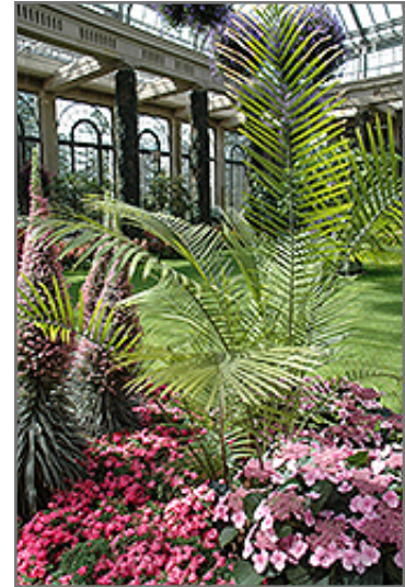
Majesty Palm

When grown indoors, Majesty Palm can be expected to grow to be about 10 feet tall at maturity, with a spread of 5 feet. It grows at a fast rate, and under ideal conditions can be expected to live for approximately 20 years. This houseplant performs well in both bright or indirect sunlight and strong artificial light, and can therefore be situated in almost any well-lit room or location. It does best in average to evenly moist soil, but will not tolerate standing water. The surface of the soil shouldn't be allowed to dry out completely, and so you should expect to water this plant once and possibly even twice each week. Be aware that your particular watering schedule may vary depending on its location in the room, the pot size, plant size and other conditions; if in doubt, ask one of our experts in the store for advice. It is not particular as to soil pH, but grows best in rich soil. Contact the store for specific recommendations on pre-mixed potting soil for this plant.