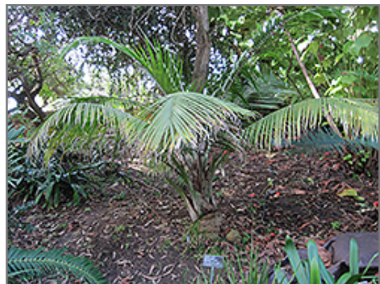
Majesty Palm