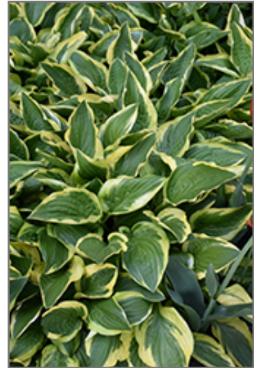
Hertha Hosta foliage

Hertha Hosta is recommended for the following landscape applications;