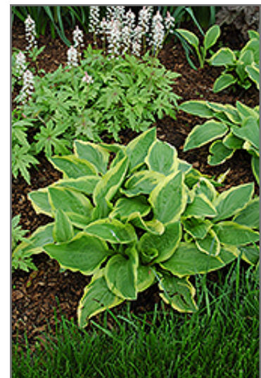
Hertha Hosta