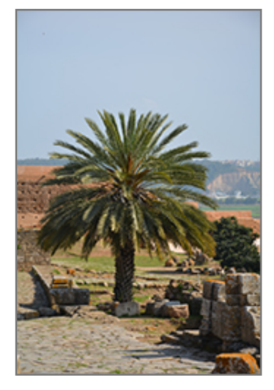
Sylvester Date Palm

This tropical plant does best in full sun to partial shade. It does best in average to evenly moist conditions, but will not tolerate standing water. It is not particular as to soil type or pH. It is somewhat tolerant of urban pollution. This species is not originally from North America.