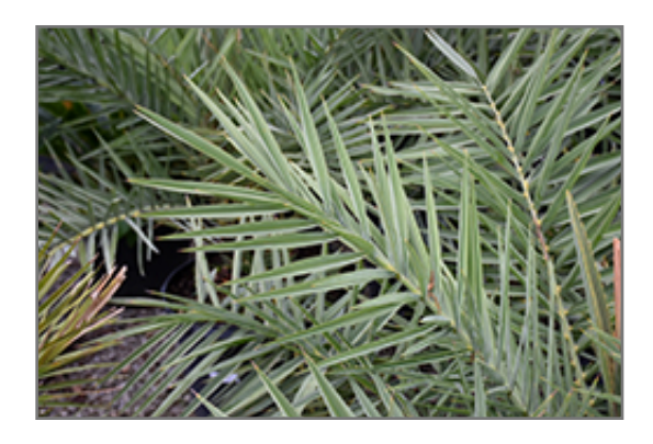
Sylvester Date Palm foliage