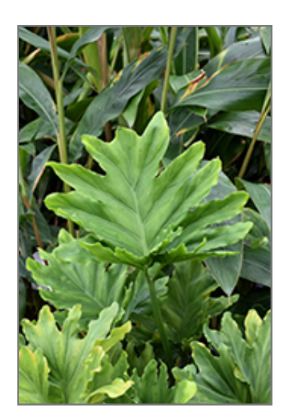
Hope Philodendron foliage

When grown indoors, Hope Philodendron can be expected to grow to be about 4 feet tall at maturity, with a spread of 4 feet. It grows at a fast rate, and under ideal conditions can be expected to live for approximately 10 years. This houseplant performs well in both bright or indirect sunlight and strong artificial light, and can therefore be situated in almost any well-lit room or location. It prefers to grow in average to moist soil. The surface of the soil shouldn't be allowed to dry out completely, and so you should expect to water this plant once and possibly even twice each week. Be aware that your particular watering schedule may vary depending on its location in the room, the pot size, plant size and other conditions; if in doubt, ask one of our experts in the store for advice. It is not particular as to soil type or pH; an average potting soil should work just fine. Be warned that parts of this plant are known to be toxic to humans and animals, so special care should be exercised if growing it around children and pets.