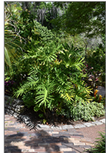
Hope Philodendron