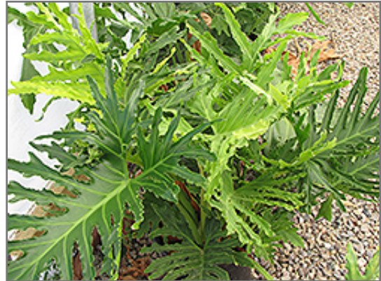
Hope Philodendron foliage

This plant is native to the tropics and prefers growing in moist environments with evenly warm conditions all year round. In our climate, it is usually grown as an outdoor annual in the garden or in a container. If you want it to survive the winter, it can be brought in to the house and provided with special care, and then returned to the garden the following season. In its preferred tropical habitat, it can grow to be around 4 feet tall at maturity, with a spread of 4 feet. However, when grown as an annual or when overwintered indoors, it can be expected to perform differently, and its exact height and spread will depend on many factors; you may wish to consult with our experts as to how it might perform in your specific application and growing conditions.