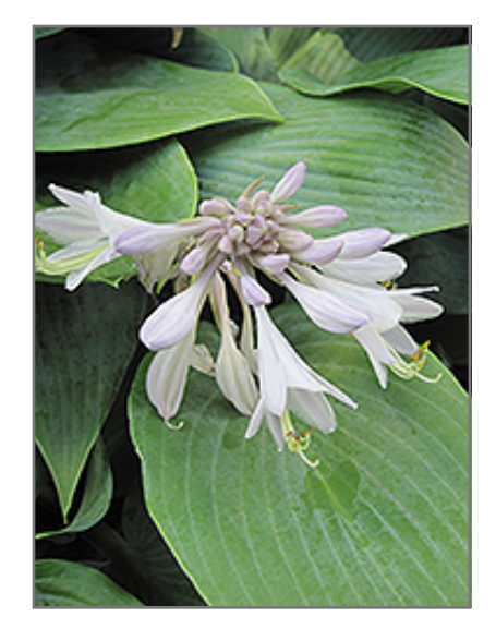
Halcyon Hosta flowers