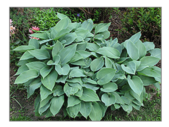
Halcyon Hosta

This is a relatively low maintenance plant, and is best cleaned up in early spring before it resumes active growth for the season. Gardeners should be aware of the following characteristic(s) that may warrant special consideration;