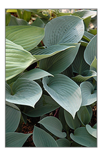
Halcyon Hosta foliage

Halcyon Hosta will grow to be about 18 inches tall at maturity extending to 24 inches tall with the flowers, with a spread of 3 feet. When grown in masses or used as a bedding plant, individual plants should be spaced approximately 30 inches apart. Its foliage tends to remain dense right to the ground, not requiring facer plants in front. It grows at a medium rate, and under ideal conditions can be expected to live for approximately 10 years. As an herbaceous perennial, this plant will usually die back to the crown each winter, and will regrow from the base each spring. Be careful not to disturb the crown in late winter when it may not be readily seen!