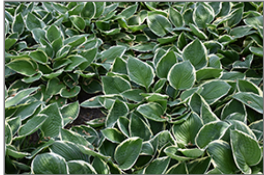
Green Gold Hosta