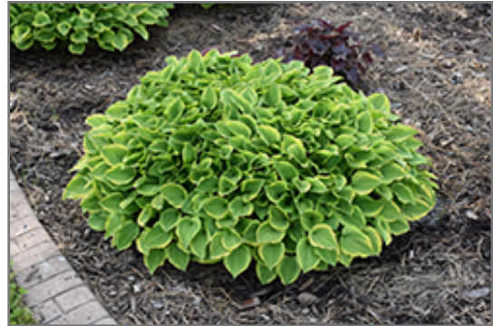
Golden Tiara Hosta

This is a relatively low maintenance plant, and is best cleaned up in early spring before it resumes active growth for the season. Gardeners should be aware of the following characteristic(s) that may warrant special consideration;