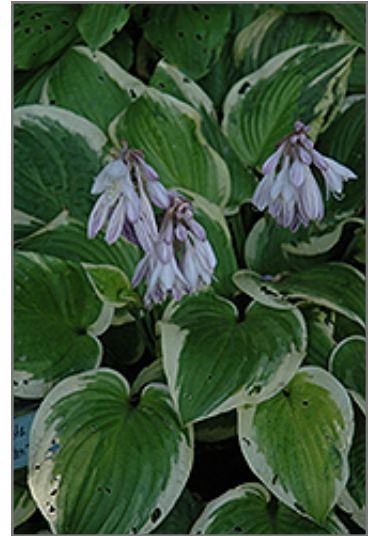
Golden Tiara Hosta flowers

This plant does best in partial shade to shade. It prefers to grow in average to moist conditions, and shouldn't be allowed to dry out. It is not particular as to soil type or pH. It is somewhat tolerant of urban pollution. This particular variety is an interspecific hybrid. It can be propagated by division; however, as a cultivated variety, be aware that it may be subject to certain restrictions or prohibitions on propagation.