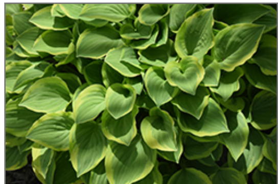
Golden Tiara Hosta foliage