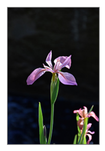
Copper Iris flowers

This interesting iris is named for the unusual copper color of its beardless and crestless blooms; native to southern wetlands; an excellent choice for low, wet garden areas or pondside planting; will quickly form dense colonies