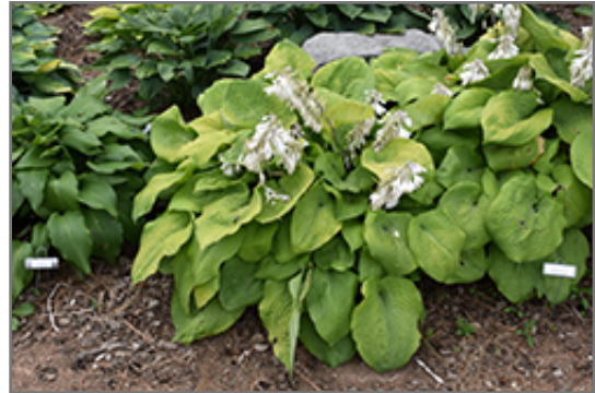
Golden Scepter Hosta