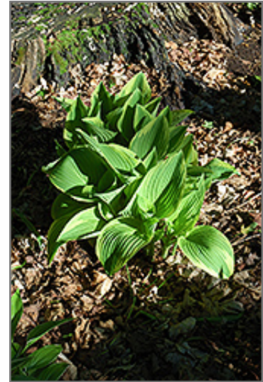
Gold Seer Hosta