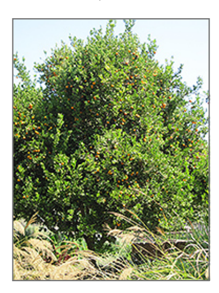
Valencia Orange