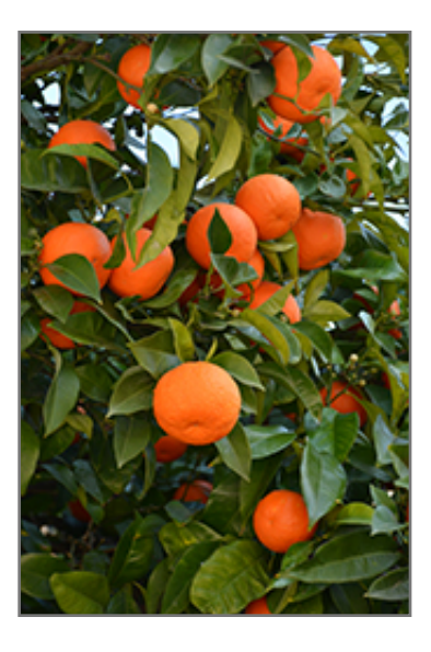
Valencia Orange fruit

Valencia Orange features showy clusters of fragrant white star-shaped flowers at the ends of the branches in early spring. It has attractive dark green evergreen foliage. The glossy oval leaves are highly ornamental and remain dark green throughout the winter. It features an abundance of magnificent orange berries from late fall to late winter.