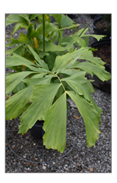
Fishtail Palm foliage

Fishtail Palm's attractive fan-shaped bipinnately compound leaves remain green in colour throughout the year on a plant with the bulk of the canopy held atop a towering trunk or stem.