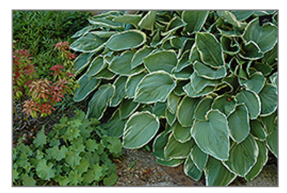
Frosted Jade Hosta

This is a relatively low maintenance plant, and is best cleaned up in early spring before it resumes active growth for the season. Gardeners should be aware of the following characteristic(s) that may warrant special consideration;