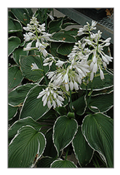
Frosted Jade Hosta flowers

Frosted Jade Hosta is a dense herbaceous perennial with tall flower stalks held atop a low mound of foliage. Its wonderfully bold, coarse texture can be very effective in a balanced garden composition.