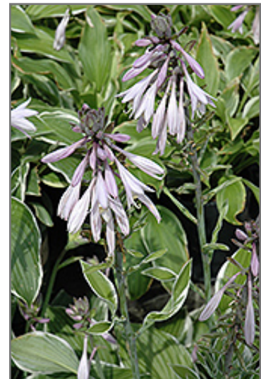
Francee Hosta flowers