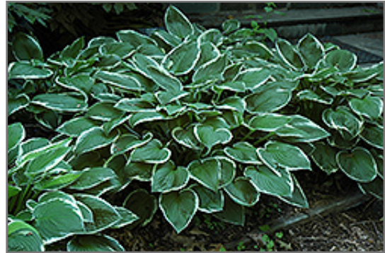
Francee Hosta