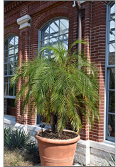
Pygmy Date Palm

This tropical plant does best in full sun to partial shade. It does best in average to evenly moist conditions, but will not tolerate standing water. It is not particular as to soil type or pH. It is somewhat tolerant of urban pollution. This species is not originally from North America.