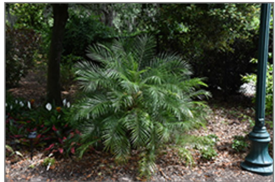
Pygmy Date Palm