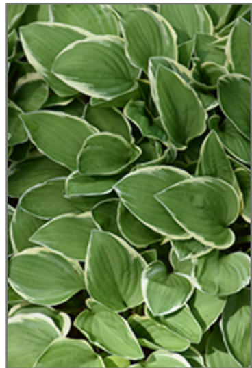
Diamond Tiara Hosta foliage