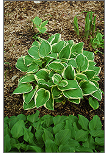
Diamond Tiara Hosta

This is a relatively low maintenance plant, and is best cleaned up in early spring before it resumes active growth for the season. Gardeners should be aware of the following characteristic(s) that may warrant special consideration;