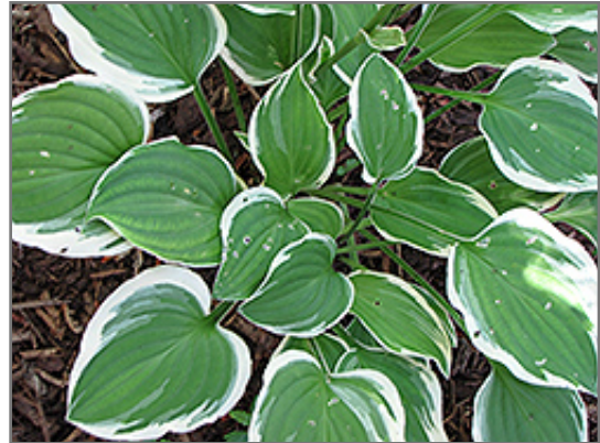
Diamond Tiara Hosta foliage

This plant does best in partial shade to shade. It prefers to grow in average to moist conditions, and shouldn't be allowed to dry out. It is not particular as to soil type or pH. It is somewhat tolerant of urban pollution. This particular variety is an interspecific hybrid. It can be propagated by division; however, as a cultivated variety, be aware that it may be subject to certain restrictions or prohibitions on propagation.