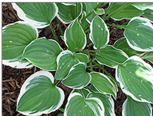
Diamond Tiara Hosta foliage

This plant does best in partial shade to shade. It prefers to grow in average to moist conditions, and shouldn't be allowed to dry out. It is not particular as to soil type or pH. It is somewhat tolerant of urban pollution. This particular variety is an interspecific hybrid. It can be propagated by division; however, as a cultivated variety, be aware that it may be subject to certain restrictions or prohibitions on propagation.