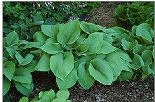
Colossal Hosta