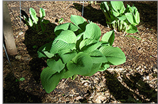
Challenger Hosta