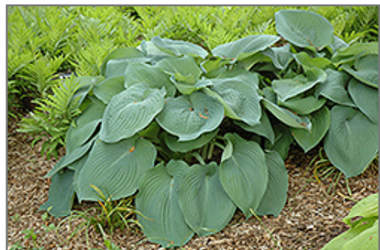
Blue Mammoth Hosta