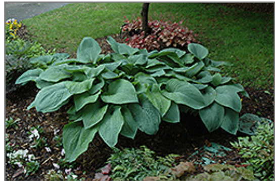
Blue Mammoth Hosta

Blue Mammoth Hosta is recommended for the following landscape applications;