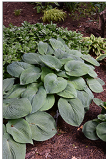
Blue Angel Hosta