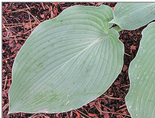
Blue Angel Hosta foliage