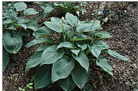
Blue Angel Hosta in bloom