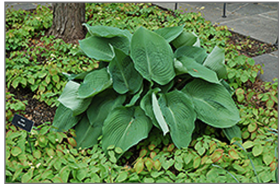
Blue Angel Hosta

Blue Angel Hosta is recommended for the following landscape applications;