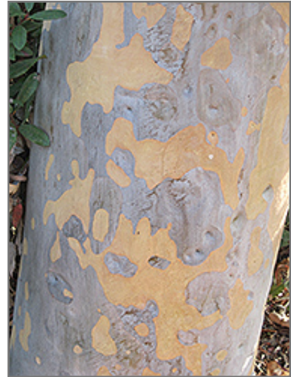
Lemon-scented Gum bark

This tree should only be grown in full sunlight. It prefers dry to average moisture levels with very well-drained soil, and will often die in standing water. It is particular about its soil conditions, with a strong preference for sandy, acidic soils, and is able to handle environmental salt. It is somewhat tolerant of urban pollution. This species is not originally from North America.