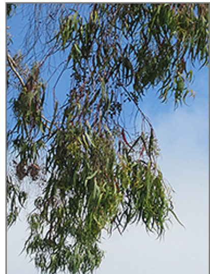
Lemon-scented Gum foliage