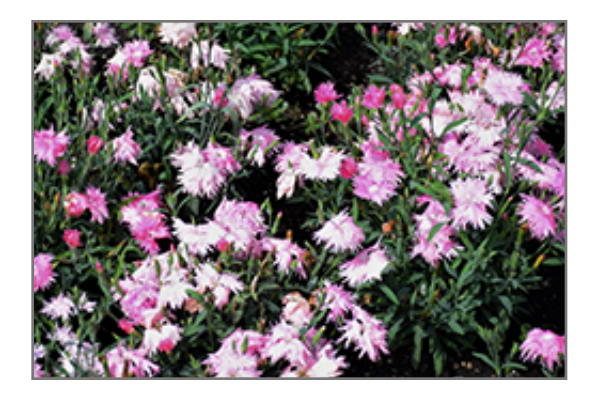
Supra Pink Pinks flowers