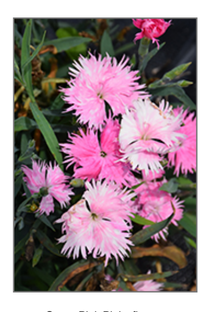
Supra Pink Pinks flowers

This is a relatively low maintenance plant, and is best cleaned up in early spring before it resumes active growth for the season. It is a good choice for attracting bees and butterflies to your yard, but is not particularly attractive to deer who tend to leave it alone in favor of tastier treats. It has no significant negative characteristics.